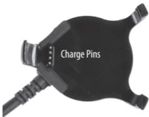
Fig. 3 Charging Cradle