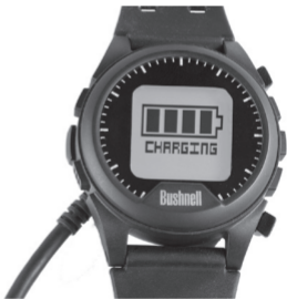
Watch on Charging Cradle

This is the easiest way to set the time. From the TIME Options Menu (Fig. 4), select SET TIME, then select BY GPS from the